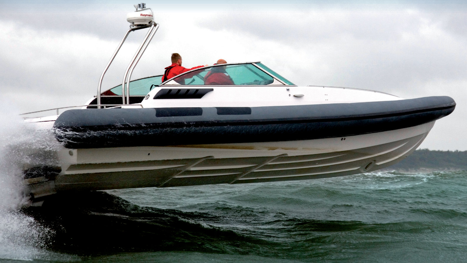
Our Arctic Turn! 37; airborne in a gale.

Reading the standard equipment list, it occurred to me that perhaps the manufacturers had trawled through an