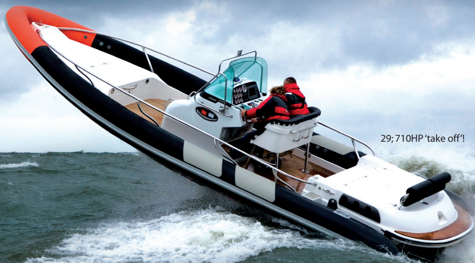
29; 710HP ‘take off!’